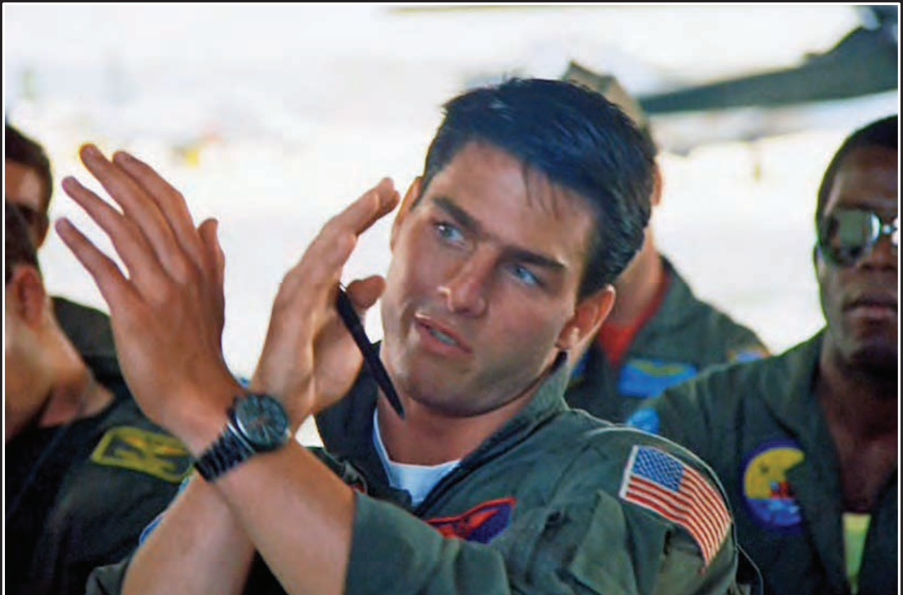
From "Top Gun"