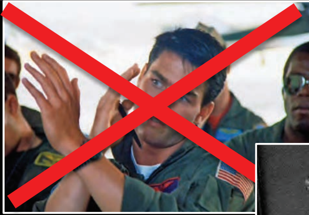
From "Top Gun"